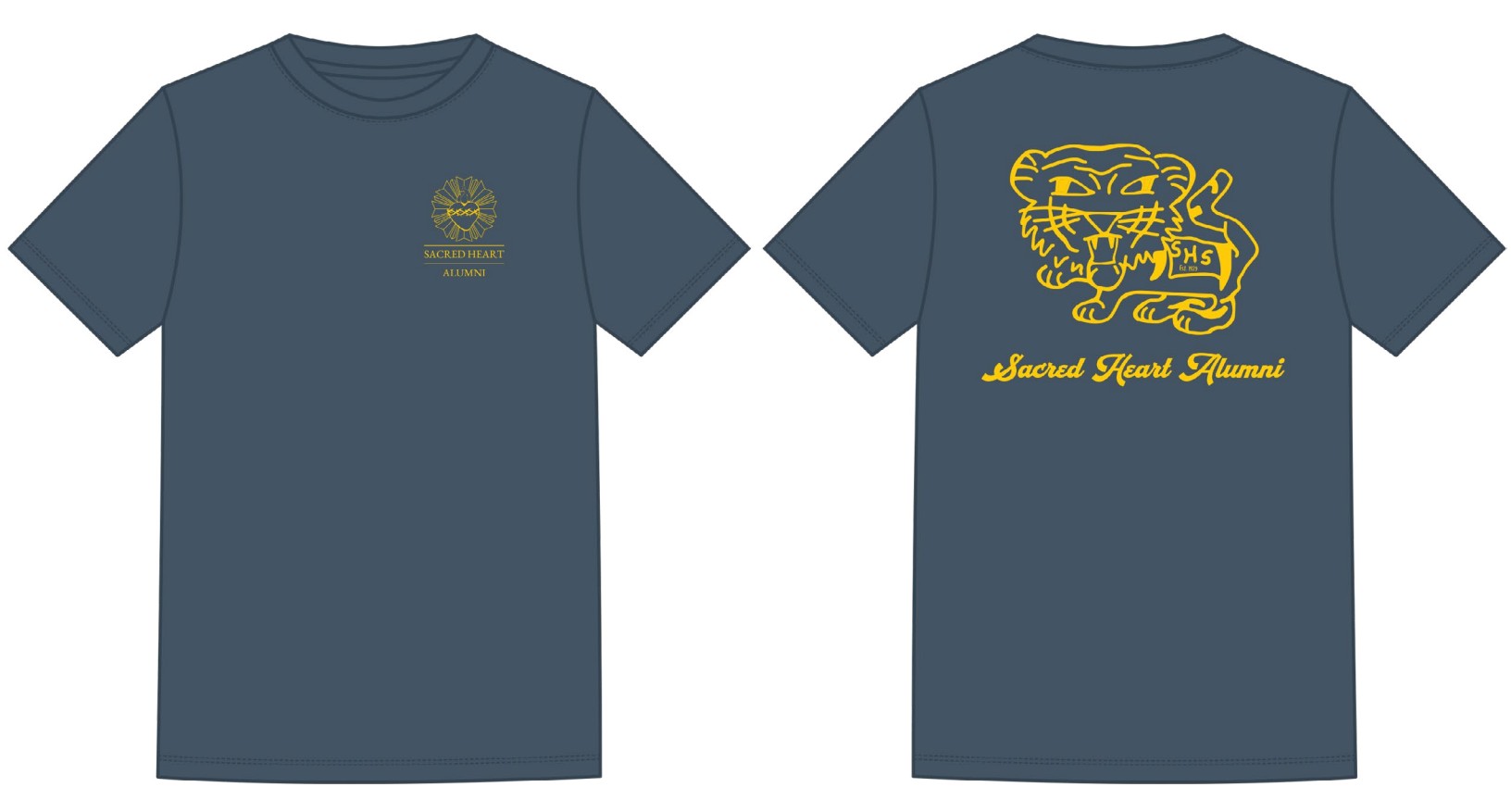
If you are interested in purchasing either shirt, <u>click here</u> to fill out the form.