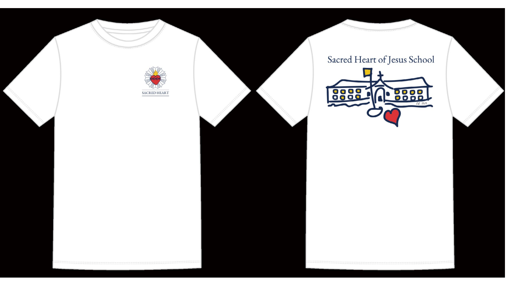
SACRED HEART SCHOOL SHIRT $20