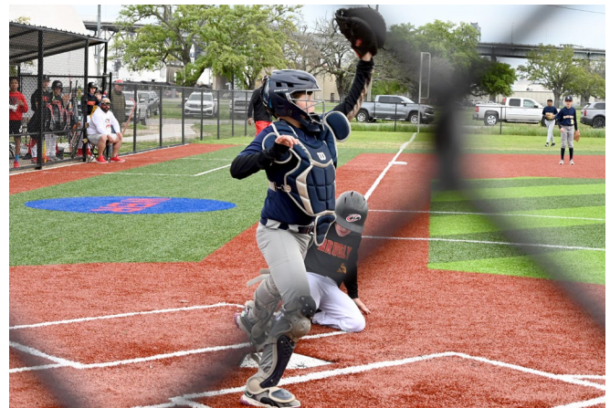
Baseball Game Candid