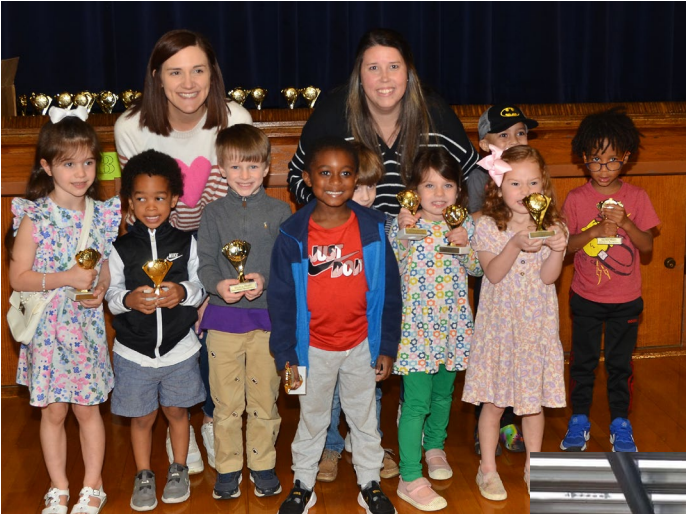
Pictures from the biddy basketball award ceremony and the first track meet of the season