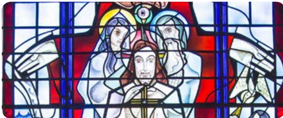
Sacred Heart of Jesus Church In Honor of the Christian Family